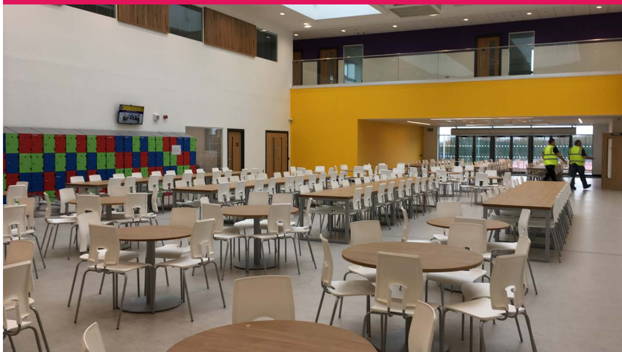
Eastern High School

Further HR implications of the proposal would need to be determined as the project develops, particularly in relation to the operation of the MIM scheme outlined above. Further guidance is required from Welsh Government to understand the full working arrangements in relation to facilities management to assess the impact, if any, on current school staff. The Governing Body and the school's leadership team would also need to consider whether any staffing changes are required to support the use of school premises by the wider community. HR People Services will provide advice and support as necessary.