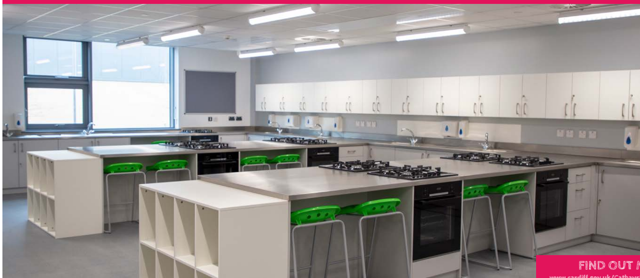
Cardiff West Community High

If the proposal goes ahead, another equality impact assessment would be carried out at the design stage. This would identify accessibility to the new build high school site. The equality impact assessment would take into account policies such as the Equality Act 2010, TAN 12: Design 2014 as well as building regulations such as BS8300, Part M and relevant Building Bulletins.